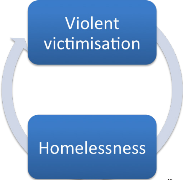
Figure 2: The cycle of revictimisation

As argued, for participants in this study the closed circuit of victimisation and homelessness began with childhood adversity. As survivors of childhood physical and sexual abuse, participants can already be understood to be at high risk of further victimisation and homelessness. The range of intense environmental risk factors associated with eventual experiences of homelessness come then on top of existing vulnerabilities to a range of